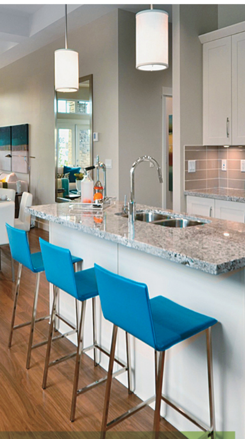
ABOVE: Kitchen in Talisman Homes' Resort Living II.