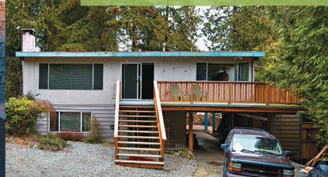
LEFT: Before-and-after at Shakespeare Homes' Mountain Highway two-storey house that had been 'hiding in the dark down by a creek.'

system designed to feed the nearby stream. The North Shore company also won for Best Renovation: $500,000 - $799,999 (for a West Van project) and was selected Renovator of the Year: Large Volume, a Grand Ovation Award (see sidebar).